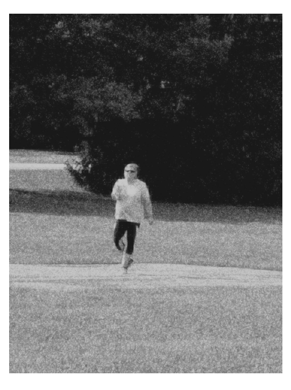
The "Sussex Incident" September 2018.