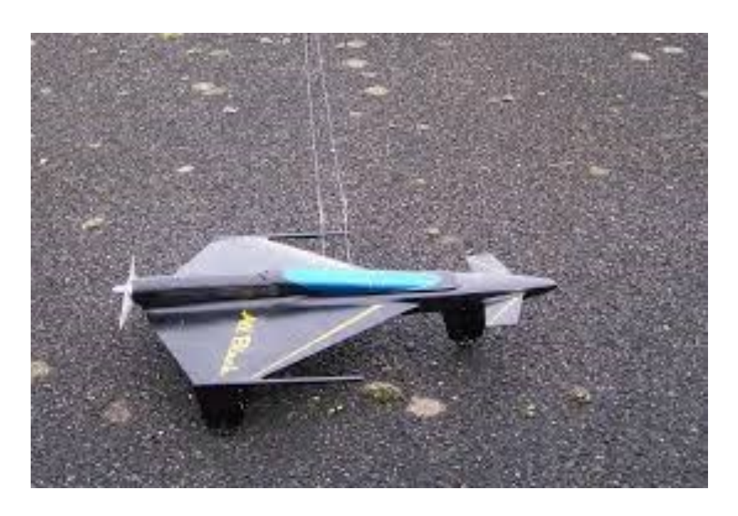
I found this pic online. Does anyone know anything about this machine? Looks like a fun sport ship if it flies well.

Treetown contests: August 26th and 27th Windy City Speed Bash. Treetown Midwest Regional Championships contest, September 3rd. Both at Aurora Municipal Airport, Sugar Grove IL.