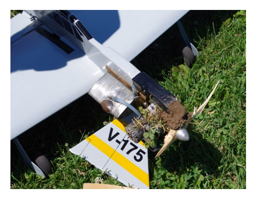
Where was this bird when we were digging holes for the field box footings? Just kidding.