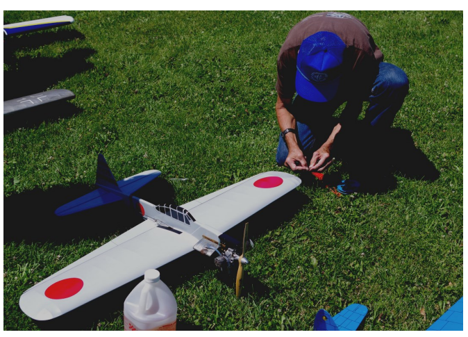
Len readies his silk covered Zero for flight. Unfortunately this one didn't go home looking so good. I hope it's fixable.