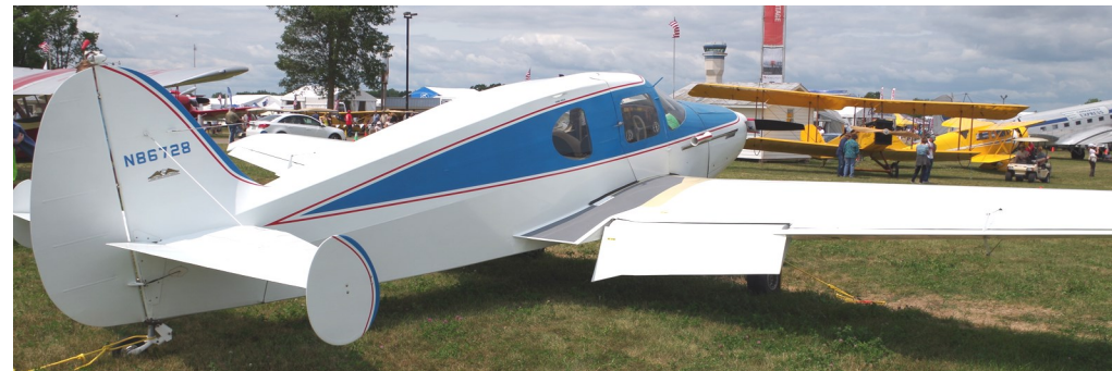
You will need to find your own 3 views, but this would make a super scale modelling subject.